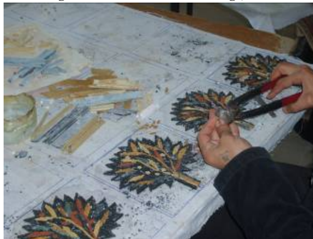
Figure.2 Mosaic production , Madaba