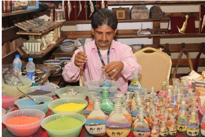
Figure 3. Sand bottles production

In the light of the above, it is very clear that there is diversity in the production of handicrafts in Jordan. Unfortunately, there is no statistical information about the handicrafts sector, only few exceptions are to be seen. Besides the cultural and social importance of the handicrafts in Jordan, the handicrafts sector also plays an important role in the economic development as part of tourism. The economic importance of the sector also lies in its employment potential and low capital investment (Mustafa, 2011).