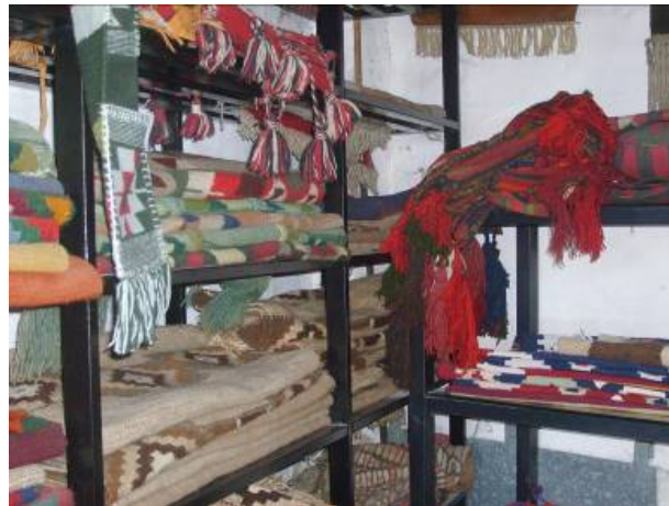
Figure.1 Traditional woven rugs, Madaba

This paper examines the current status of the Jordanian handicrafts as well as the challenges facing it, in order to make suggestions for appropriate strategies to develop it.